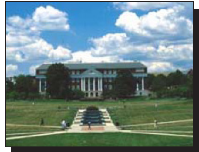
University of Maryland

In the afternoon, parents and students divided into three groups to participate in role-play simulations of situations related to terrorism and international security. One group participated in a simulation of emergency management and law enforcement in the wake of a Basque separatist attack in Spain. The second group participated in a simulation of multilateral negotiations after a series of attacks modeled on the 2008 Mumbai attacks. And the third group participated in a simulation of third-party negotiations during a series of violent terrorist and counterterrorist strikes along the border of Turkey and Iraq. The students and parents then came